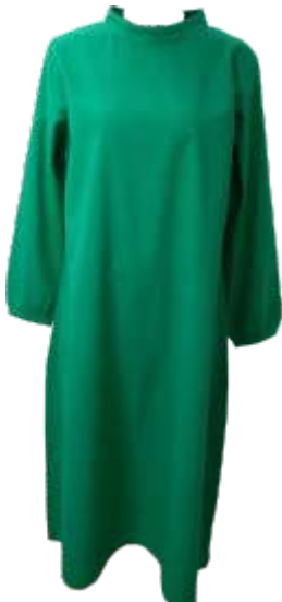
Surgical Gown (Front)