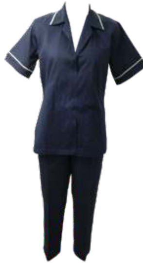
Staff Dress (fabric quality – 100% cotton twill weave fabric)