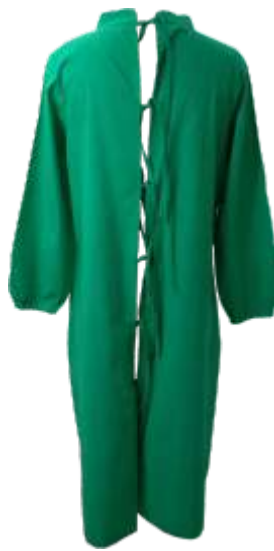
Surgical Gown (Back)