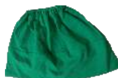
Cotton Shoes Cover