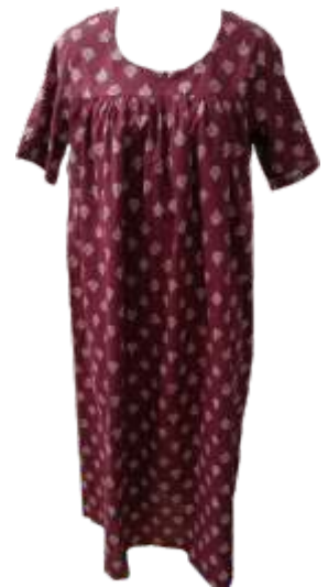
Patient Maternity Gown (fabric quality – 100% printed cotton with slubs)