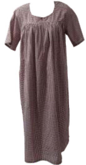
Patient Gown for Ladies (fabric quality – 100% cotton yard dyed checks)