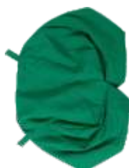
Cotton Surgical Cap