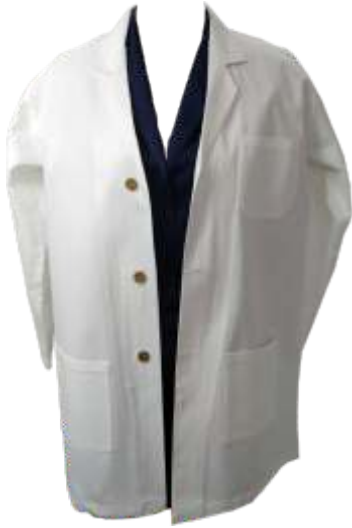
Doctor Coat / Lab Coat (Fabric Quality – 100% Cotton twill weave fabric)