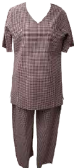
Unisex Patient Dress (for both male and female)